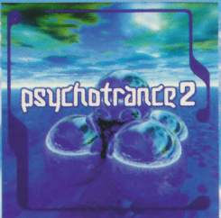
PSYCHOTRANCE II MM80020

LOOK FOR KEOKI'S FORTHCOMING SINGLE- "CATERPILLAR" AVAILABLE ON MOONSHINE MUSIC CD SINGLE & 12" VINYL